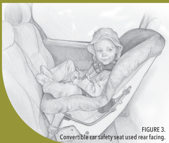
FIGURE 3. Convertible car safety seat used rear facing.