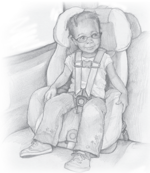
FIGURE 4. Forward-facing car safety seat with harness.