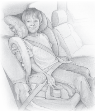
FIGURE 5. Belt-positioning booster seat.