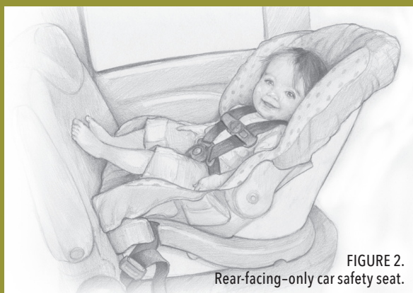
FIGURE 2. Rear-facing-only car safety seat.