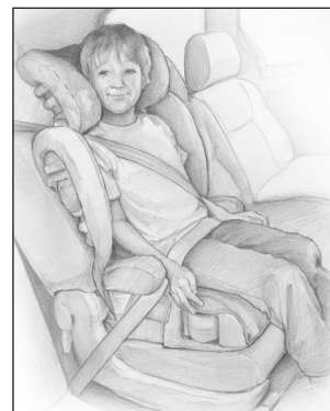
Figure 6. Belt-positioning booster seat.

Booster seats are for older children who have outgrown their forward-facing seats. All children whose weight or height exceeds the forward-facing limit for their car safety seat should use a belt-positioning booster seat until the vehicle seat belt fits properly, typically when they have reached 4 feet 9 inches in height and are 8 to 12 years of age. Most children will not fit in most vehicle seat belts without a booster until 10 to 12 years of age. All children younger than 13 years should ride in the back seat. Instructions that come with your car safety seat will tell you the height and weight limits for the seat. As a general guideline, a child has outgrown a forward-facing seat when any of the following situations is true: