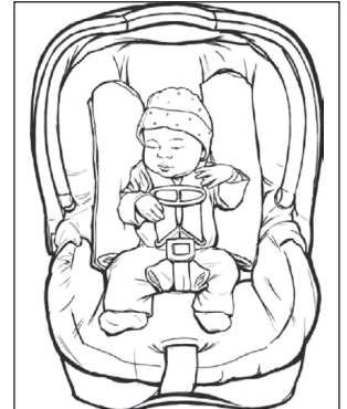
Figure 4. Car safety seat with a small cloth between the crotch strap and infant; retainer clip positioned at the center of the chest, even with the infant's armpits; and tightly rolled receiving blankets on both sides of the infant.

A: Bulky clothing, including winter coats and snowsuits, can compress in a crash and leave the straps too loose to restrain your child, leading to increased risk of injury. Ideally, dress your baby in thinner layers and wrap a coat or blanket around your baby over the buckled harness straps if needed.