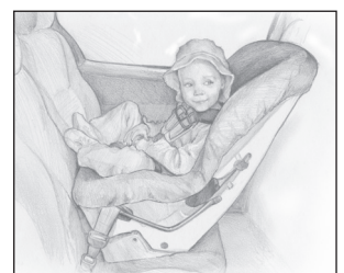
Figure 3. Convertible car safety seat used rear facing.