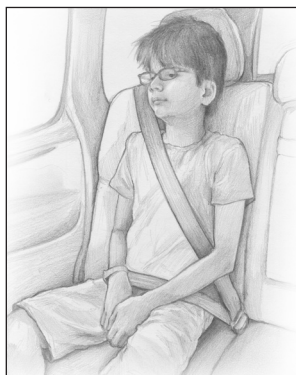
Figure 7. Lap and shoulder seat belts.