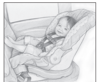
Figure 2. Rear-facing-only car safety seat.